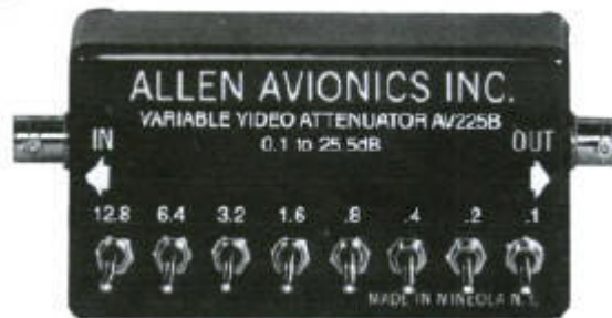
Attenuation (Frequency response at maximum attenuation of 25.5dB)